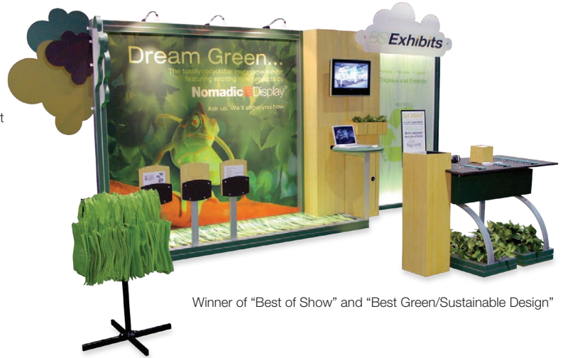
Winner of "Best of Show" and "Best Green/Sustainable Design"

p.s. Be sure to visit our Web site at www.nomadicdisplay.com for more designs, services and our latest promotions!